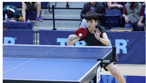
FIGURE 7: PHOTO COURTESY OF GRANT BERGMANN