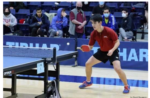
FIGURE 8: PHOTO COURTESY OF GRANT BERGMANN