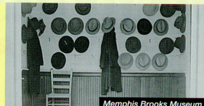
Memphis Brooks Museum

Between 1935 and 1941, photographers such as Dorothea Lange and Russell Lee were hired by the Farm Security Administration (FSA) to traverse the South and capture images that wove a visual narrative of socioeconomic and cultural life during the Depression era. 1