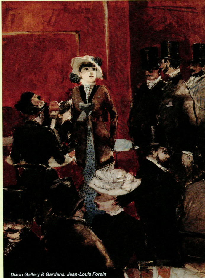
Dixon Gallery & Gardens: Jean-Louis Forain