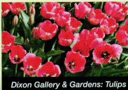
Dixon Gallery & Gardens: Tulips