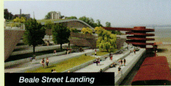
Beale Street Landing

Delta has added a sixth international destination from its hub at Memphis International Airport with a weekly flight to Mexico City. Other international destinations served by Delta from Memphis include year-round, daily flights to Amsterdam and Toronto and seasonal flights to Cancun, Cozumel and Montego Bay. In total, Delta currently offers Memphis customers more than 220 peak-day departures to 82 nonstop destinations.