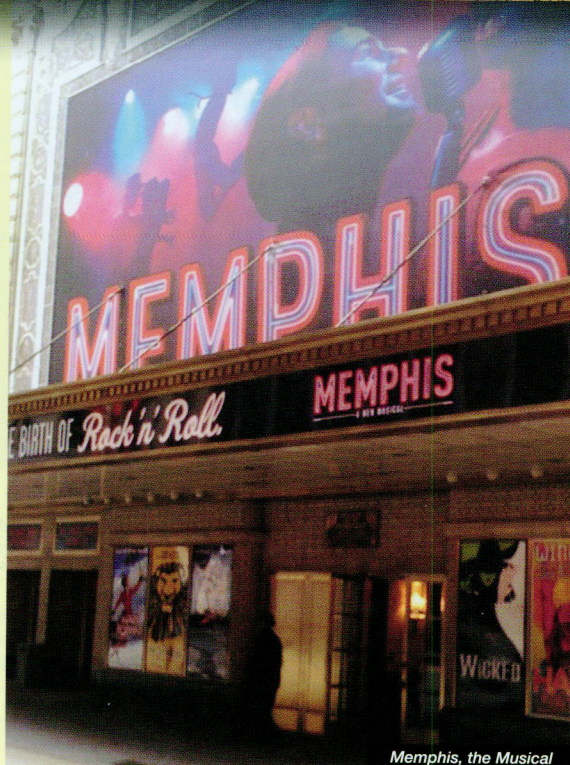
Memphis, the Musical

Fans from around the world will celebrate the music, movies and legacy of the King of Rock 'n' Roll. Special events include concerts, dances, charitable events, sporting events and more. Two highlights include the annual Ultimate Elvis Tribute Artist Contest Semifinal and Final Rounds and the annual Candlelight Vigil.